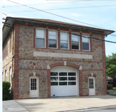
Fire District 3