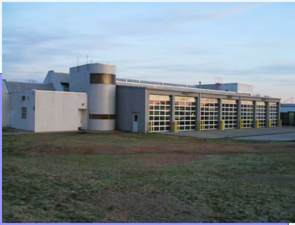
Fire District 4