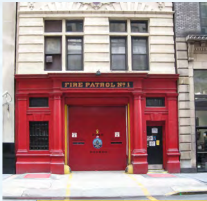
Fire District 1