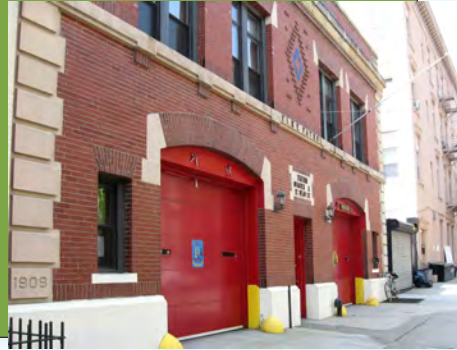
Fire District 2