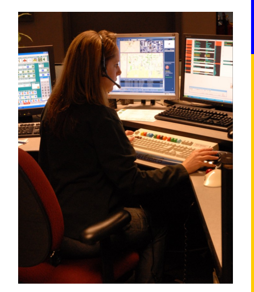
A PSJC Telecommunicator assists a caller in the 9-1-1 Operations Center.